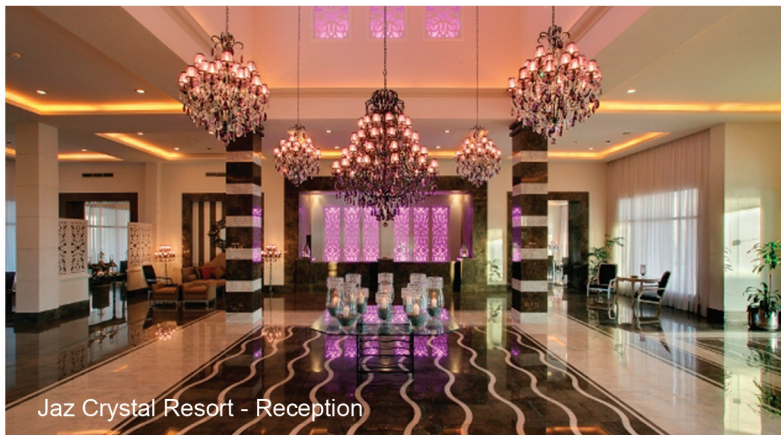
Jaz Crystal Resort - Reception