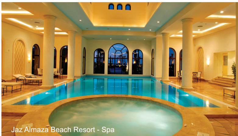
Jaz Almaza Beach Resort - Spa