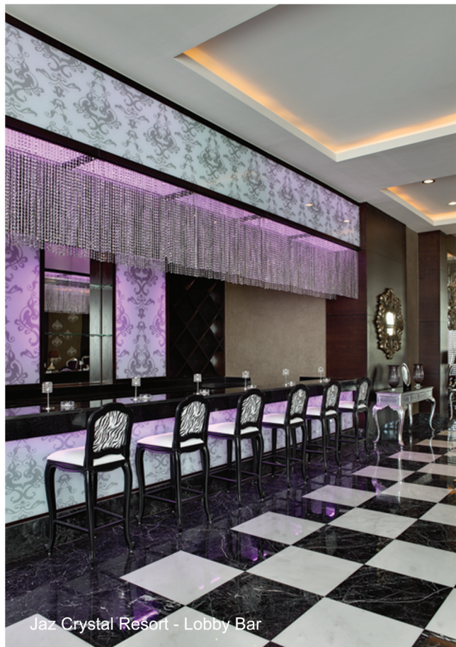
Jaz Crystal Resort - Lobby Bar

For some pure indulgence the spa and health center will definitely provide a welcome break for all those seeking relaxation, tranquility, and some stress free times. With world class therapists and professional masseuses as well as an indoor pool, steam and sauna rooms, gym, yoga and meditation rooms, the spa will be the perfect spot for that needed time of escapism.