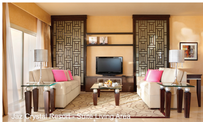
Jaz Crystal Resort - Suite Living Area