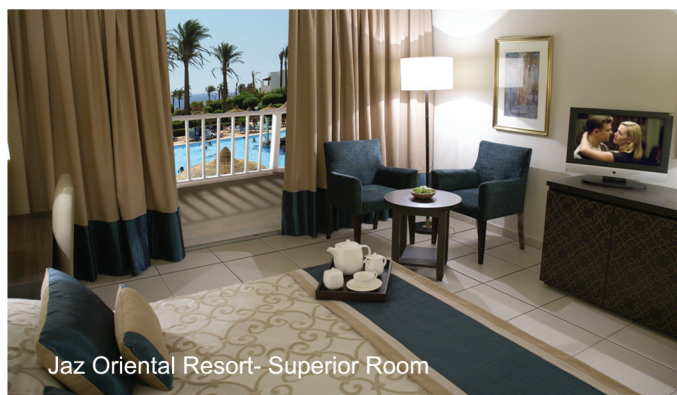
Jaz Oriental Resort- Superior Room