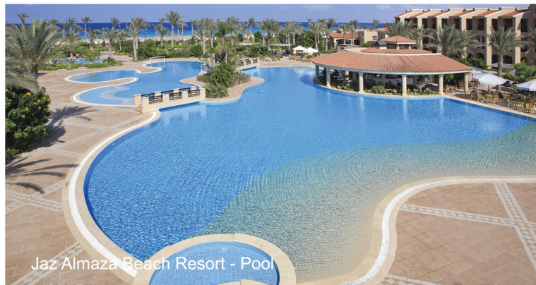
Jaz Almaza Beach Resort - Pool

With the sparkling Mediterranean providing the azure backdrop, world class hotels and residential properties all nestled in grade-A surroundings, featuring a myriad of leisure and recreational amenities, Almaza Bay is the latest jewel in Mersa Matruh.