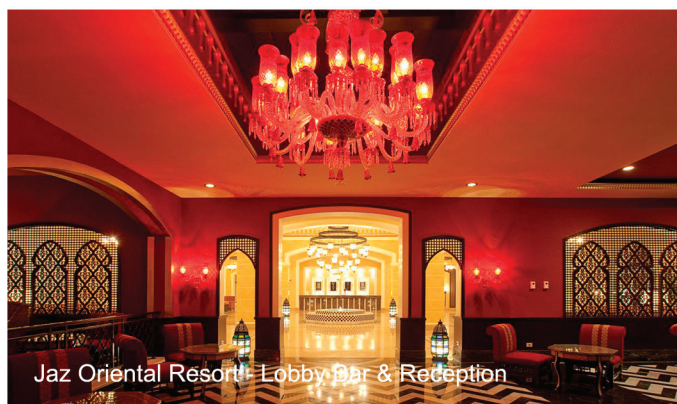
Jaz Oriental Resort- Lobby Bar & Reception